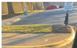
Curb/ sidewalk access at Woodland and West South Street