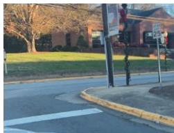
Curb/sidewalk access at Woodland and West Main Street